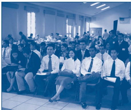
Missionaries and premissionaries waiting to be seen